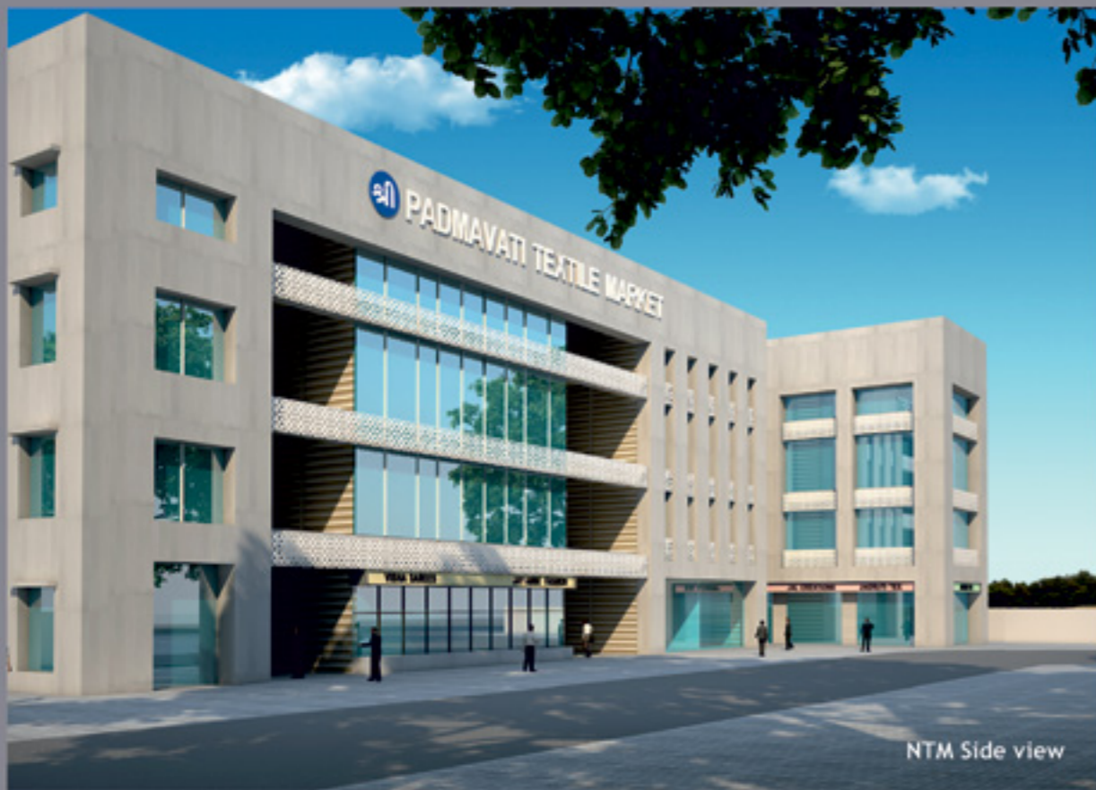
NTM Side view