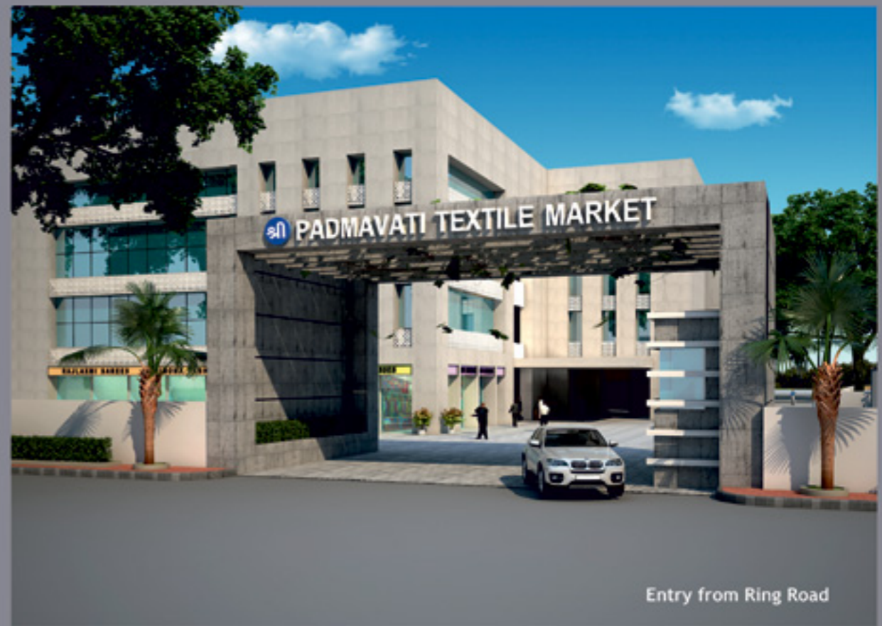
Entry from Ring Road