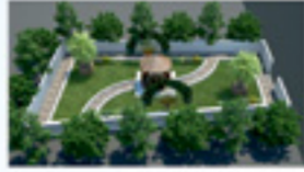
Gazebo & Garden