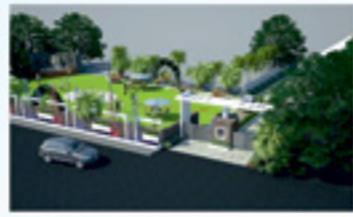
Entrance & Garden