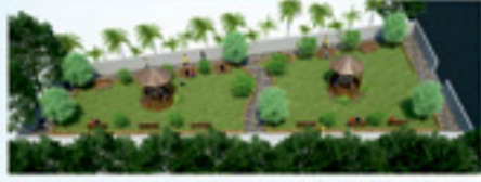
Senior Citizen Garden