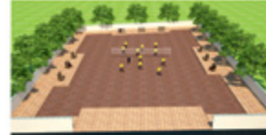
Volley Ball Court