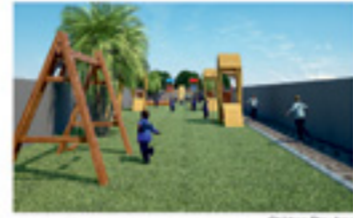
Children Play Area